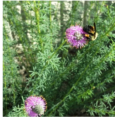
Bumble bees gather pollen on purple prairie clover