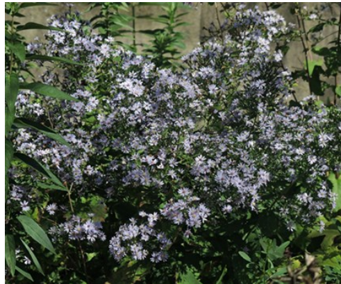
New England aster blooms in the fall garden